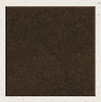
Premium Black* *Full Perpetual Warranty does not apply to this color