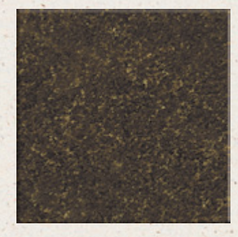
Medium Black* *Full Perpetual Warranty does not apply to this color